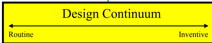
Figure 1. The Design Continuum

The inventive end of the design continuum has two additional characteristics. Inventions require knowledge that often resides outside the individual, company, classroom, or field of study. The knowledge necessary to solve what appears to be a mechanical problem may be found in chemistry, electricity, or some other domain. A second characteristic is the presence of conflicting or contradictory design requirements. An inventive problem arises, for example, if a product must be both strong and lightweight—characteristics that usually necessitate a trade-off. Or it may be encumbered by requirements that are in direct conflict with one another, such as rigidity and flexibility.